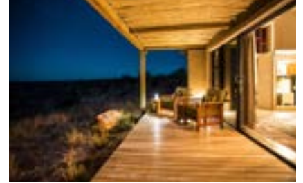
MISAVA SAFARI CAMP