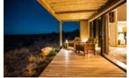
MISAVA SAFARI CAMPS