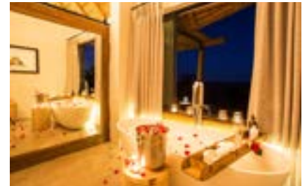
MISAVA SAFARI CAMPS